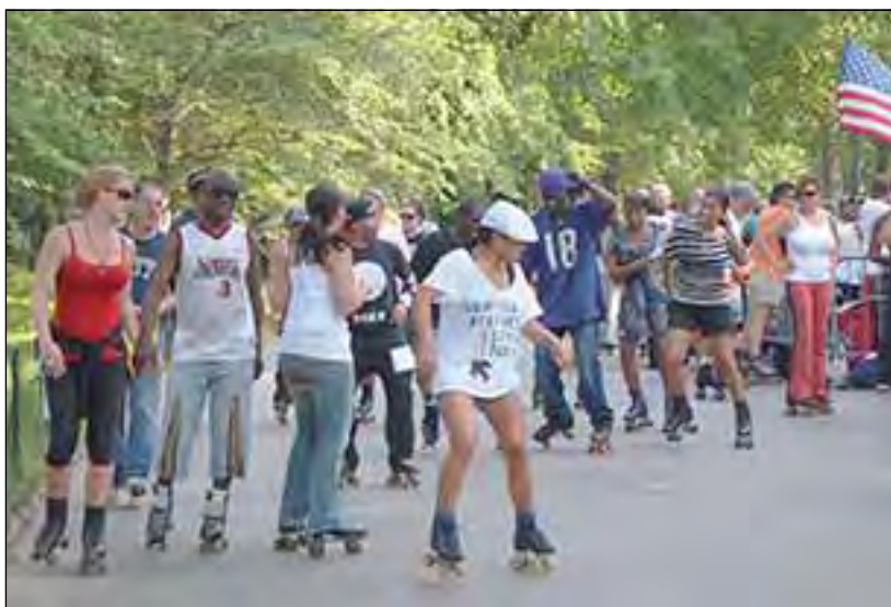
CPDSA Skaters show their enthusiasm for the Music and the day.