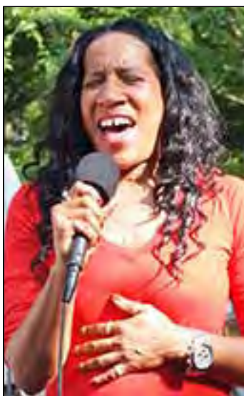
Xaviera Gold performed her song: "You Used to Hold Me"