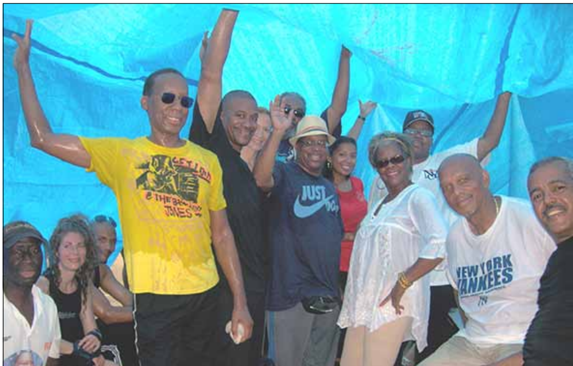
Under the Blue Tarp—August 2011 was the wettest month ever recorded!