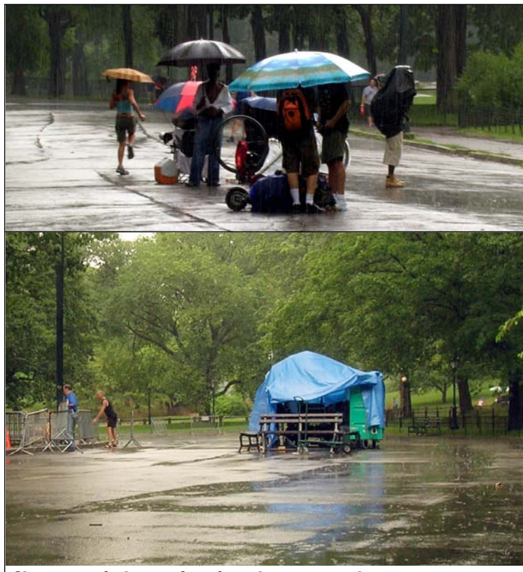
Skaters await the passing of another summer shower