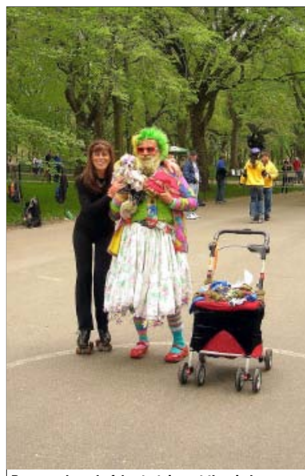
Bunny and a colorful entertainer at the circle