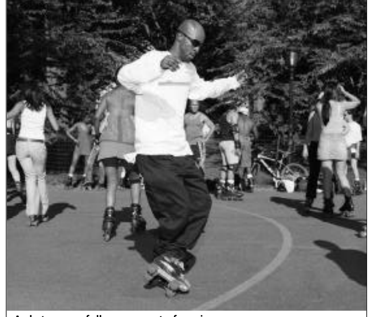
A skater gracefully comes out of a spin.

So, at the beginning of spring and summer of 2003, I say to everybody; whether you want to accept it or not, we are truly the first reality show and we should enjoy each other as we experience it each week, and we should enjoy ourselves in the most positive ways possible.