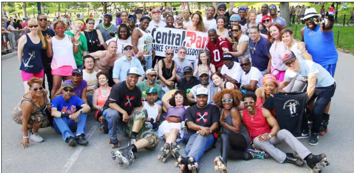
CPDSA Skate Family—Memorial Day 2014