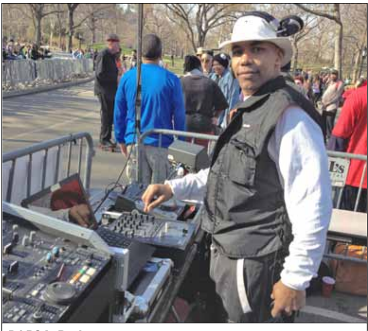
DJ RC LaRock