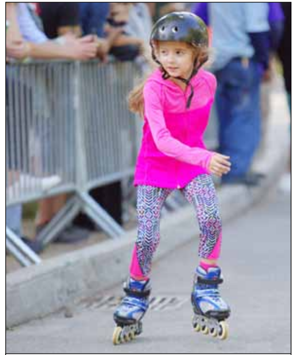
The Next Generation