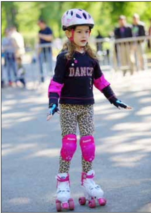
The Next Generation