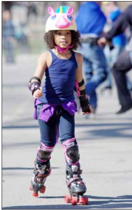
The Next Generation