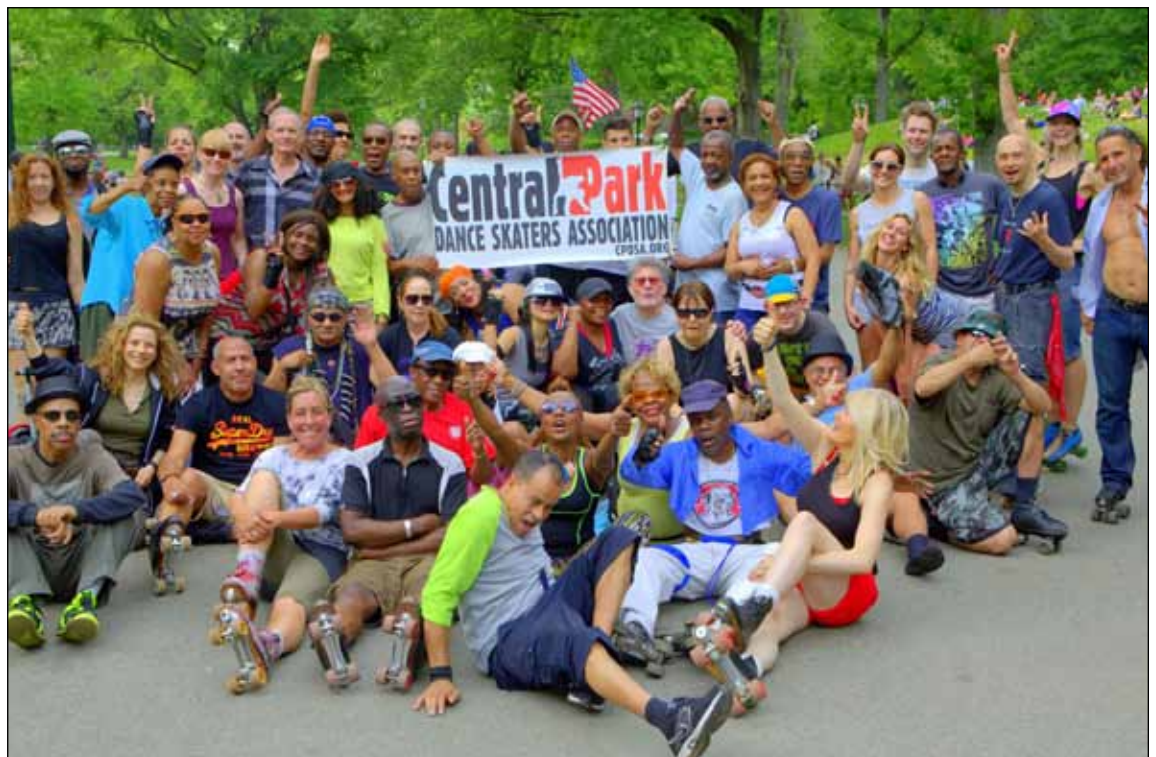
CPDSA Skate Family, Memorial Day Weekend 2015