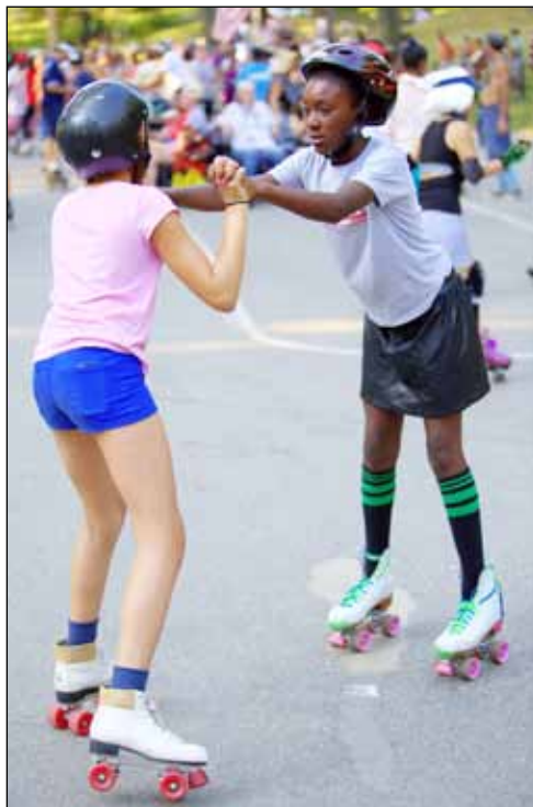
Two new CPDSA skaters