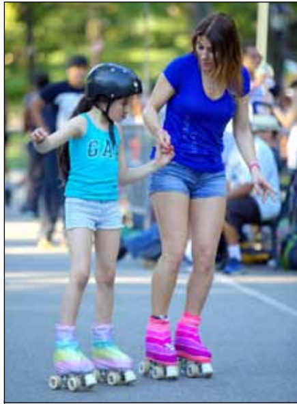
Mother & Daughter