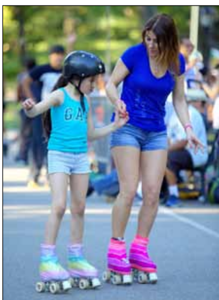
Mother & Daughter