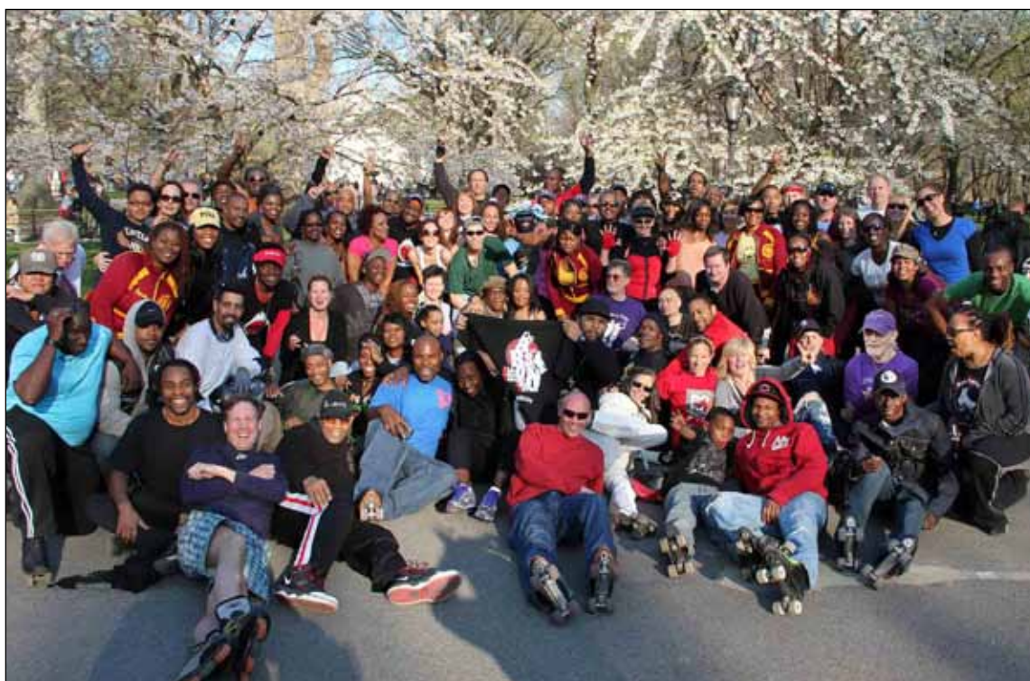
2011 CPDSA skate family group portrait. Traditionally taken when the cherry blossoms are in their full glory.