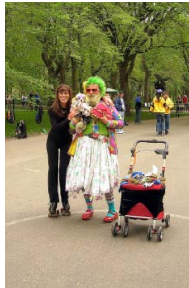
Bunny and a colorful entertainer at the circle