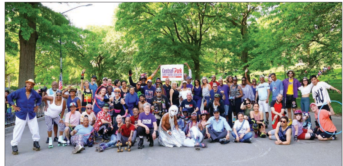
May 2022 Skate Family

This is everything we have hoped for and more, “repaving” being the key word; it is the one thing that will improve our skating experience the most. If indeed Skaters Road gets “repaved,” and not just repaired and resurfaced, that means it will be able to support the heavy truck loads and traffic during non-skating large events, allowing us to enjoy skating on a safe, smooth surface for many years.