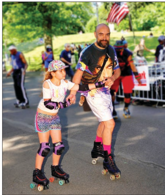
Jaimpaca and daughter visiting from Canada